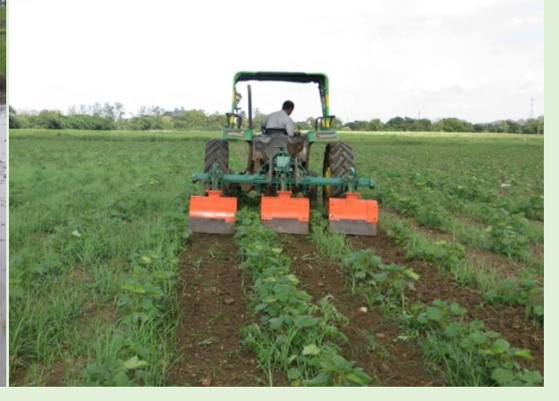
Tractor operator rotary weeder