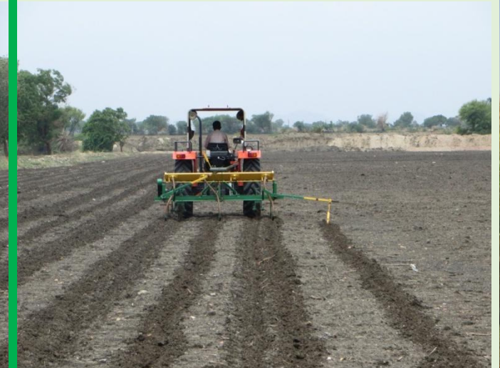
Tractor operated cotton planter