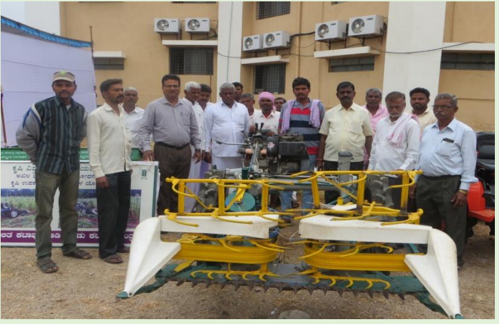
Self propelled reaper binder