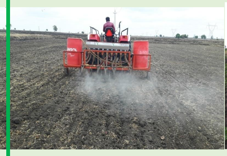
ractor operated planter cum herbicide applicator