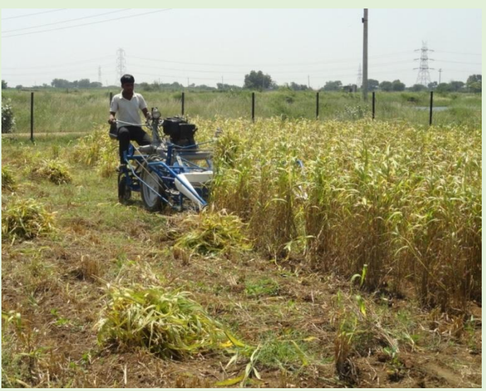
Self propelled reaper binder