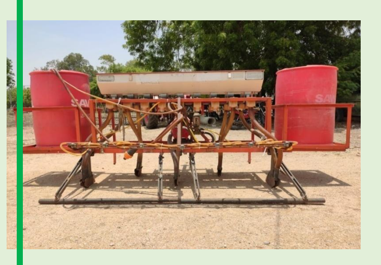
Planter cum herbicide applicator