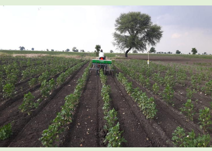
Small tractor operated weeder for wide row crops