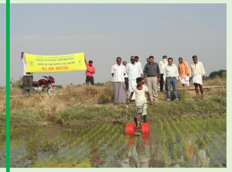
Self propelled weeder