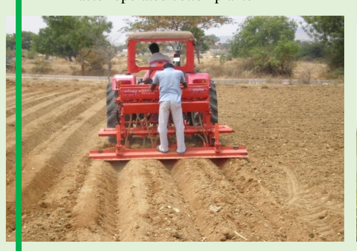
Tractor operated raised bed planter