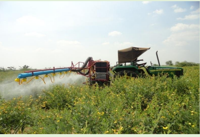
Tractor operated air sleeve boom sprayer