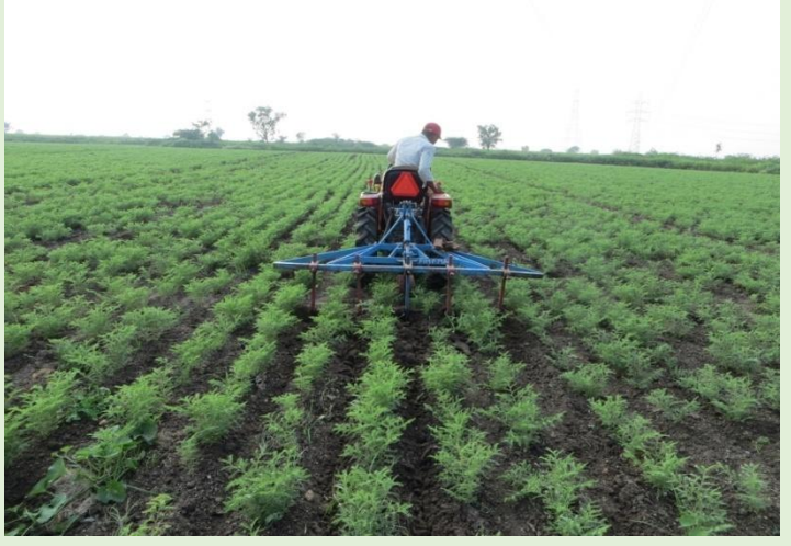
Small tractor operated weeder for narrow row crops